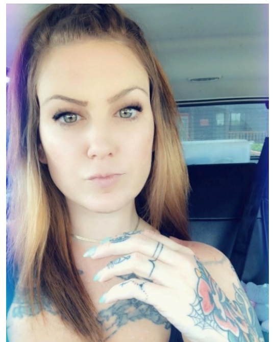
Dedication sent in by Paige Leysath