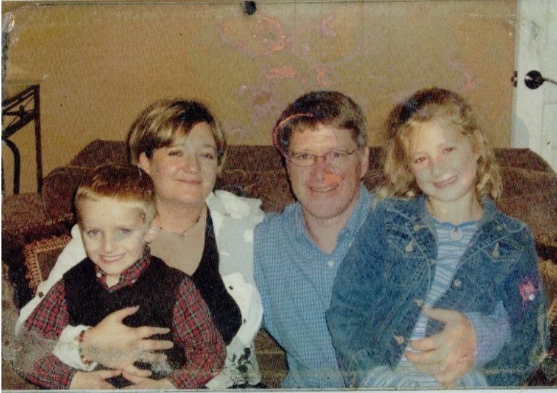
Dedication sent in by Melanie and Jim Boudreaux